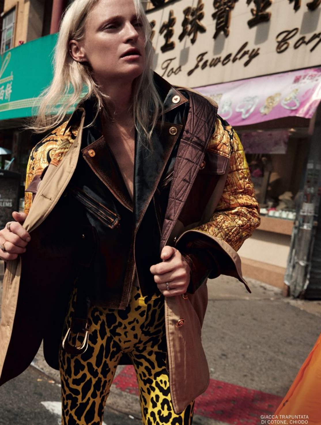
GIACCA TRAPUNTATA DI COTONE, CHIODO