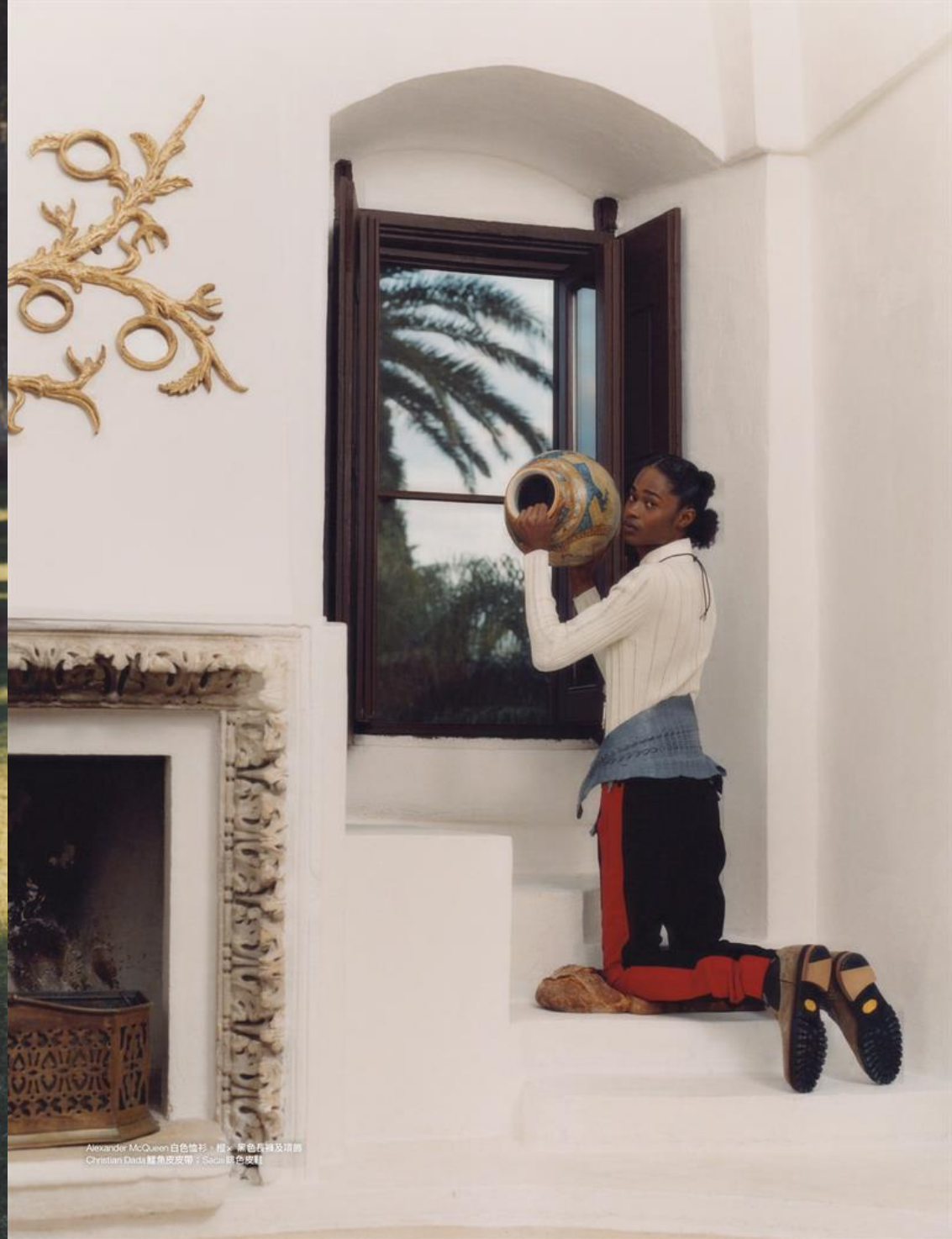
Alexander McQueen 白色恤衫、橙、藍色長褲及項鍊 Christian Dior 鱈魚皮皮帶、Sofia 白色夾鞋