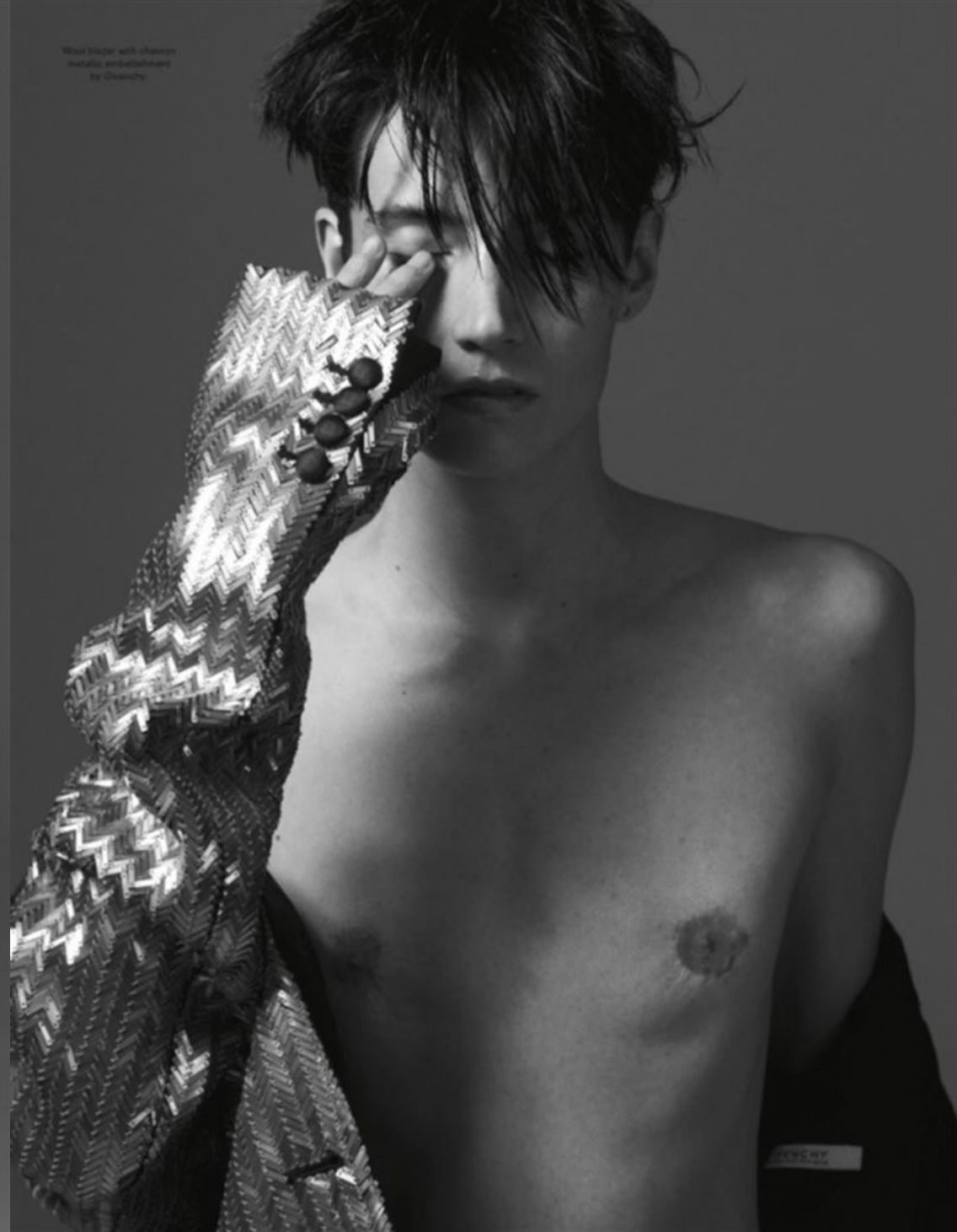
Wool blazer with shimmer metallic embellishment by Givenchy.