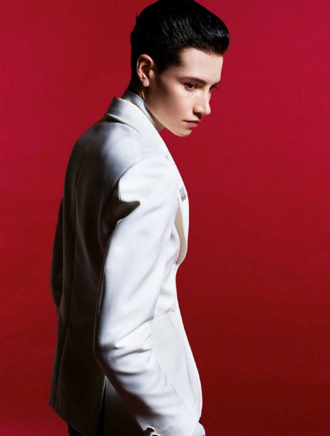
Metallic-suede blazer and leather belt (DROMe), cotton T-shirt (Novel Tees Designers) and polyester and wool pants (Tiger of Sweden)