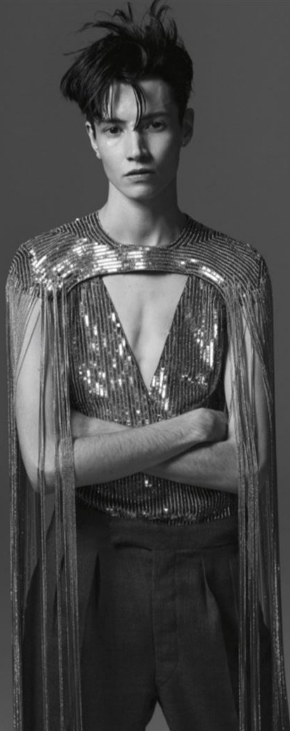
Crew-neck silk dress with fringed epaulettes by Givenchy. Pleated wool trousers from The Contemporary Wardrobe.