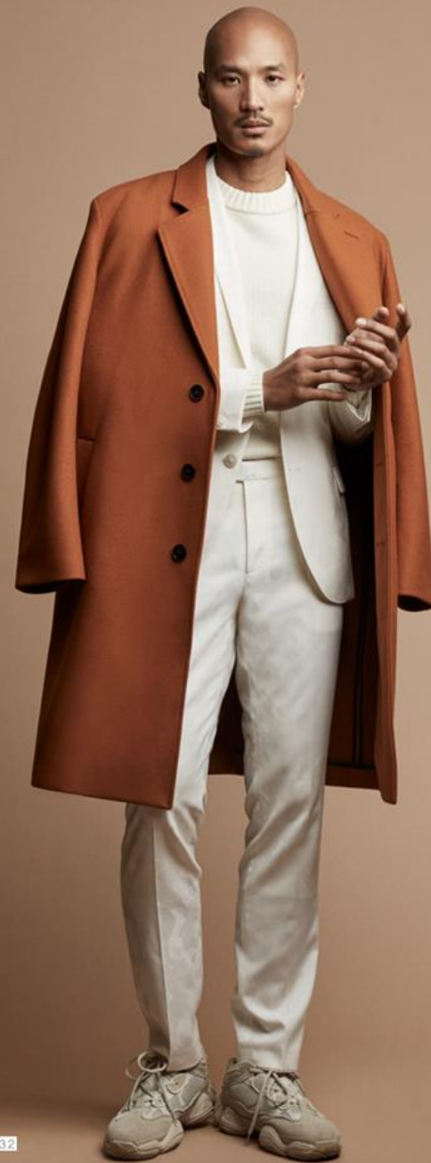
Complet et manteau Hugo; chandail Boss; chaussures Yeezy Adidas Hugo suit and jacket; Boss sweater; Adidas Yeezy sneakers