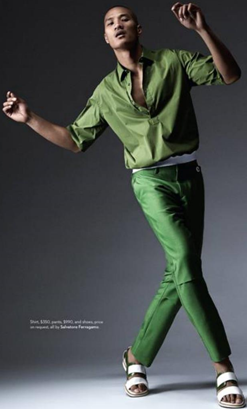
Shirt, $350, pants, $990, and shoes, price on request, all by Salvatore Ferragamo.